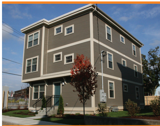
Neighborhood Opportunities Program: Affordable homes in Pawtucket for families who were formerly homeless.

Over 6,000 people are still homeless in Rhode Island. Housing First currently serves only 150 persons. The construction of apartments for the Housing First program and provision of supportive services can help us end homelessness in Rhode Island, create jobs in the homebuilding and service sectors and save the state money.